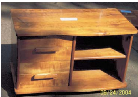
Prosopis cabinet produced by the Kenya Forestry Research Institute (KEFRI)

Prosopis end grain flooring is in high demand in Texas. Above is tung oil finish and below is water based flooring finish.