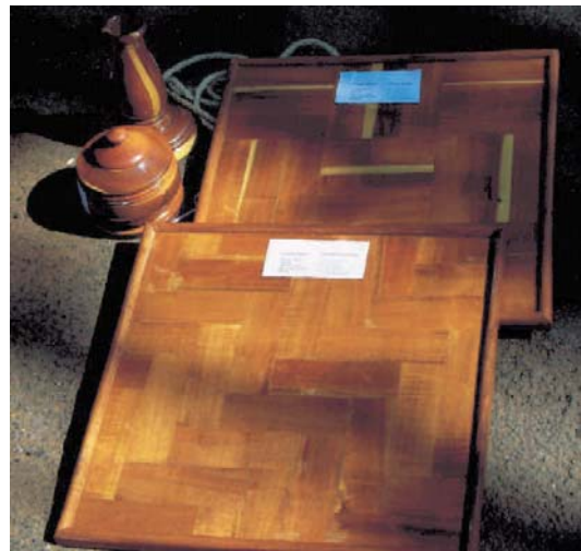
Unstained plain sawn Prosopis flooring produced by the Kenya Forestry Research Institute (KEFRI)