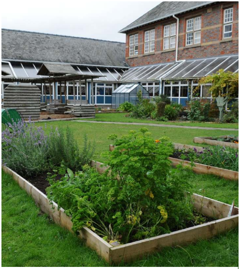
A range of raised beds in schools